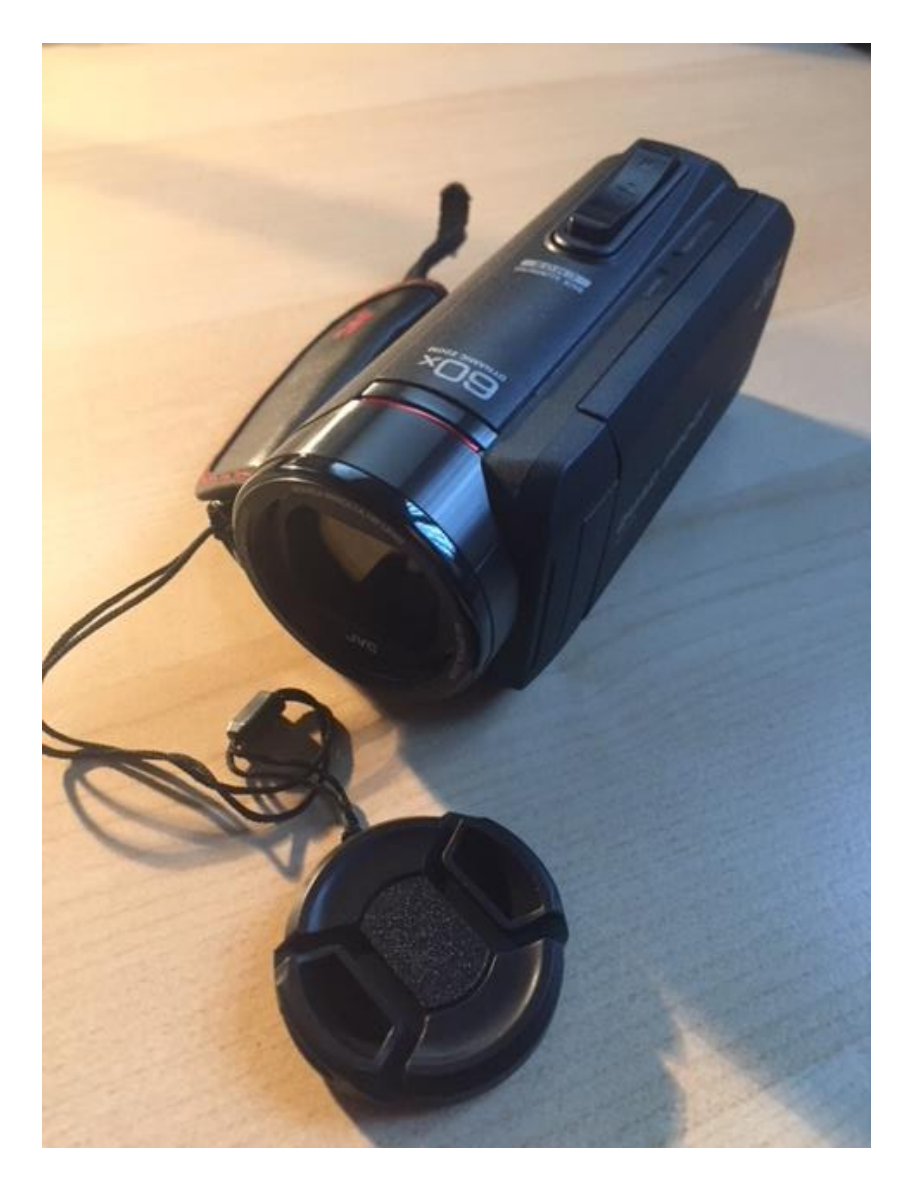
Before taking out on the water